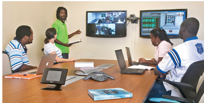
UVI students and faculty, along with members of the general community, take advantage of cutting-edge videoconferencing and high speed network connections made possible by NSF grant funds to VI-EPSCoR.

Improvements completed not only allow local researchers to work better together via videoconference between islands, but with other scientists worldwide. The resulting collaborations strengthen the depth and quality of research efforts, while reducing its cost in terms of travel and time.