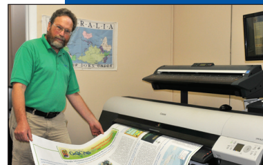
GeoCAS printers provide resources for UVI student researchers and others.

GeoCAS also participated in fourteen community events, involving 680 participants. Subjects presented ranged from tsunami awareness to training in map and compass navigation, and data collection for marine spatial planning exercises.