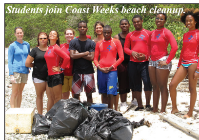
Students join Coast Weeks beach cleanup.

The NSF grant project included funding for initiatives throughout the Territory, as well as at the University of the Virgin Islands, which houses VI-EPSCoR. These were designed to help the Territory's young people become better prepared to enter the workforce or to pursue further education. They also served to directly strengthen the Territory's science and technical workforce.