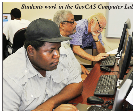
Students work in the GeoCAS Computer Lab