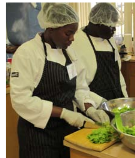
Central High After School Culinary Club