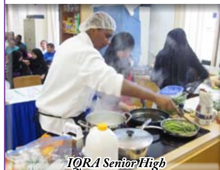
IQRA Senior High