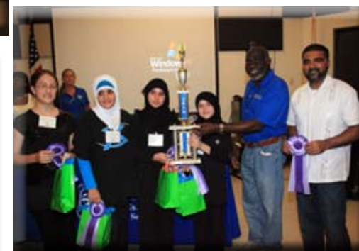
IQRA Junior High