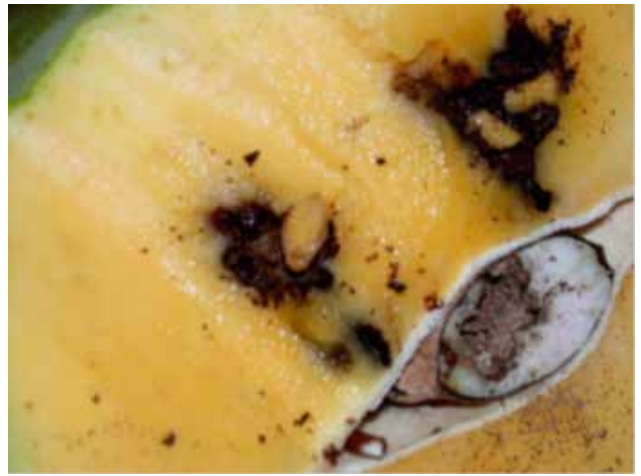
Mango fruit with weevil larvae infestations in both the seed pit and pulp.

Testing of treatment methods for mango weevil is drastically needed. But this study will be about monitoring, which is the first and primary step of integrated pest management. Hopefully, the monitoring project can be followed by treatment trials. In the meantime, if you have mango trees and are suffering from mango weevil, focus on the preventive and sanitation methods; use existing treatment methods if warranted, and expect results (or at least efforts) from our agriculturists on finding ways to manage this invasive insect pest.