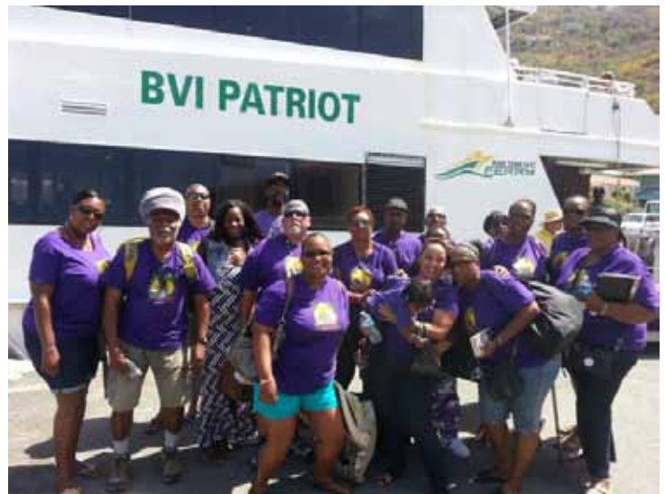
Crucian Hikers & Explorez Group posing for a group photo before boarding the BVI Patriot.

From Jost Van Dyke, the Crucian Hikers and Explorerz Group went on to visit Virgin Gorda, east of the big island of Tortola. They hiked the three-quarter-mile rocky trail through a dry forest ecosystem of 1,370 feet above sea level to the summit. At the summit, they continued to the lookout tower where they got a