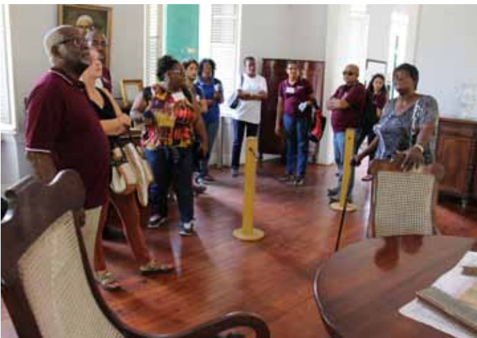
For the group, a blend of Virgin Islands culture was a welcome break on the tour. They totally enjoyed Whim Plantation which included a tour of the Great House, museum, and the grounds.

Fruits of the U.S. Virgin Islands and Their Nutritional Values and the “Home Grown” poster series.