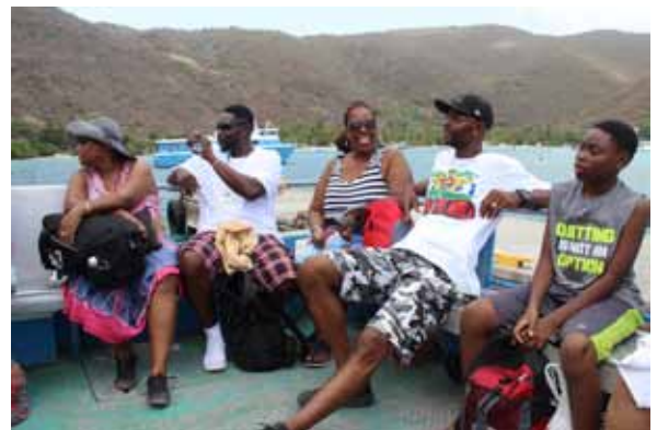
Crucian Hikers on the way to Jost Van Dyke.