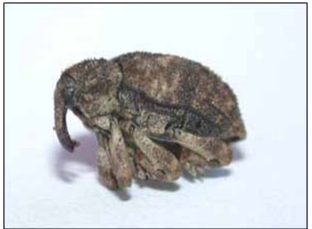
Adult mango weevil, which easily hides within bark of mango trees.