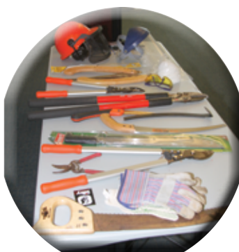
Tools of the trade.