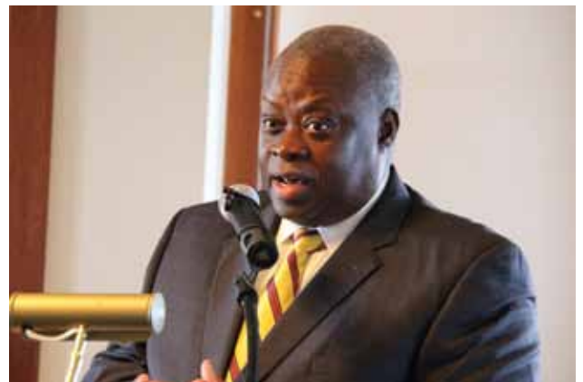
Governor Kenneth E. Mapp spoke of his vision to move the agricultural industry in the U.S. Virgin Islands during the opening ceremony of the conference.