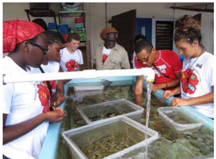
Students from Agriculture Enrichment Summer Camp learn about Aquaponics at Ivanna Eudora Kean High School.

Field trips were made to Ivanna Eudora Kean High School’s aquaponic farm, and two local landscaping & plant nurseries, as well as other local farms. Additionally, the students experienced tool safety & usage demonstrations; they had an introduction to 4-H & FFA Organizations, as well as engaging in UVI Marine Science Center boat trips and canine inspection demonstration.