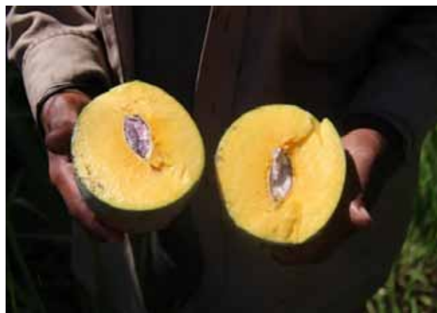
Best existing monitoring method is to slice open and observe developing fruits for infestations. This proposed study seeks a less labor-intensive monitoring method that finds weevils before infestations.