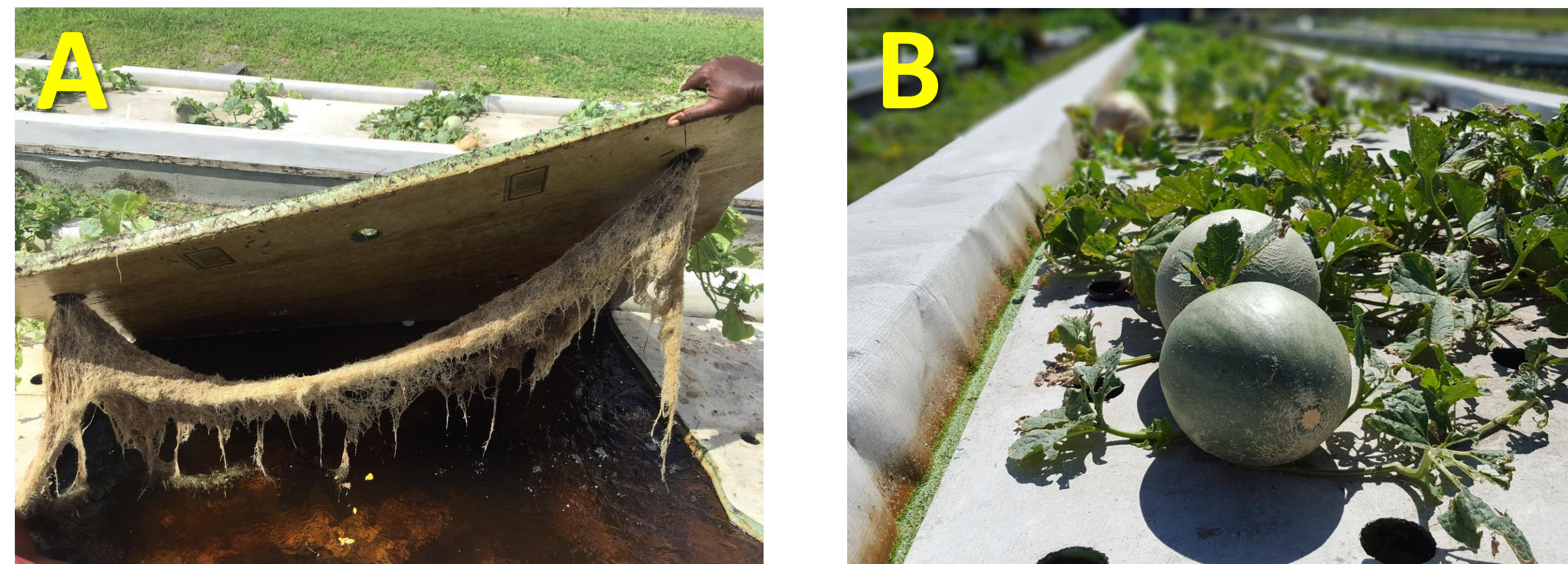
Fig. 2 Styrofoam rafts lifted to show the cantaloupe root system (A) and green fruits 10 days before harvest (B) grown on the UVI Aquaponics System.

Plant material. Three-week old cantaloupe ( Cucumis melo ) 'Goddess' seedlings grown on peat-based substrate were transplanted into 1.2 × 2.4-m (2.97 m 2 ) styrofoam rafts on the aquaponics system on Oct 2, 2015 (day after transplanting, DAT 1). We planted 2 plants/raft spaced every 1.2 × 1.2 m in a density of 1.485 plants/m 2 and used 12 rafts/trough.