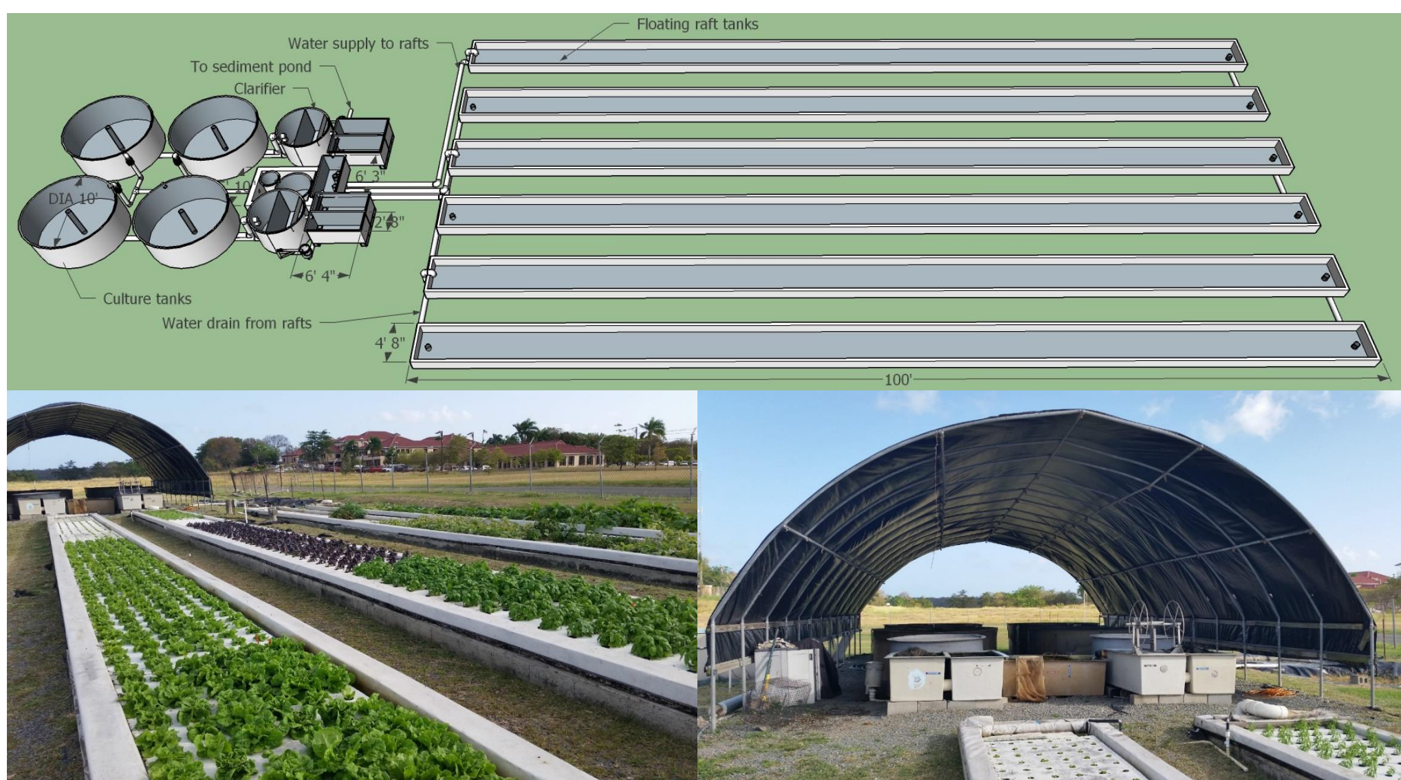
Fig. 1 UVI Commercial Aquaponic System.

UVI Commercial Aquaponic System. The system used consisted of three main components: fish rearing, solids removal and hydroponic vegetable production troughs. The hydroponic troughs were 30 × 1.2 × 0.3 m with a volume of 11.3 m 3 and a surface area of 214 m 2 . The water flow rate on the troughs was 125 L/min for a retention time of 3 h. Fish waste products were the source of nutrients for plant growth (Fig. 1).