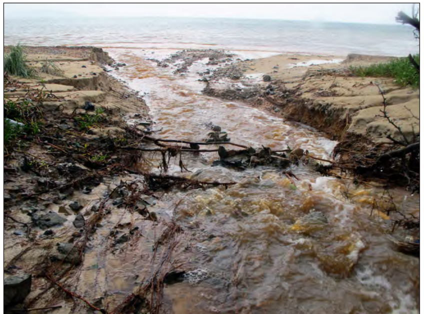
Discharge into Boiler Bay from a severely eroding foot trail.

soil erosion is very evident and widespread throughout the USVI. Persistent land development, an ever-growing network of unpaved roads and foot trails, and alterations to natural drainage patterns continuously create conditions that increase erosion and enhance