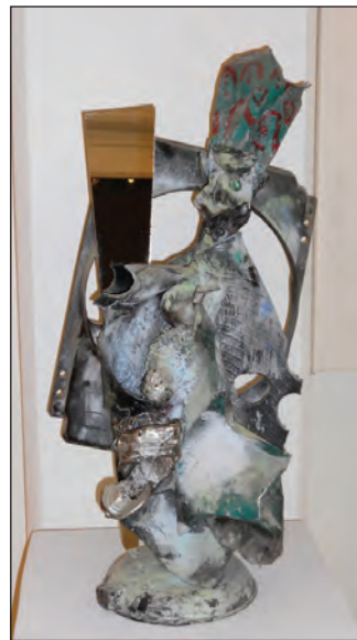
Interior artwork included photographs of masques by Chéby, images one and two; and sculptures by Jean Herard Celeur and André Eugène, images three and four, respectively.