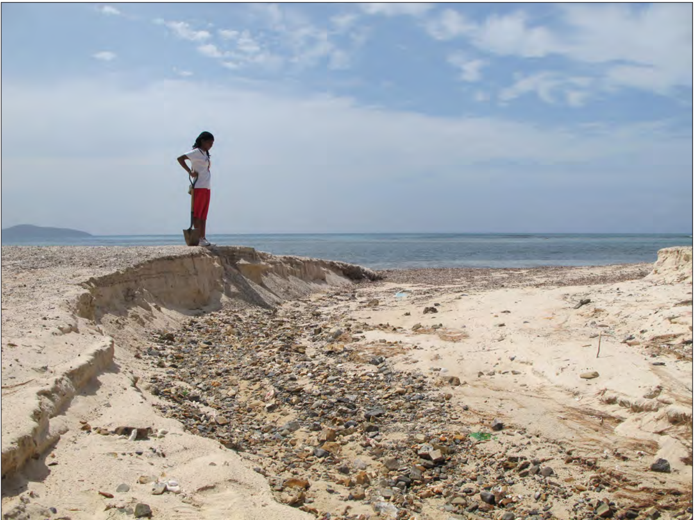
Resulting beach erosion from discharge into the bay.

the delivery of sediment into the sea. These conditions, combined with rugged topography, seasonally intense rainfall, and unchecked land development practices exacerbate sedimentation issues even further.