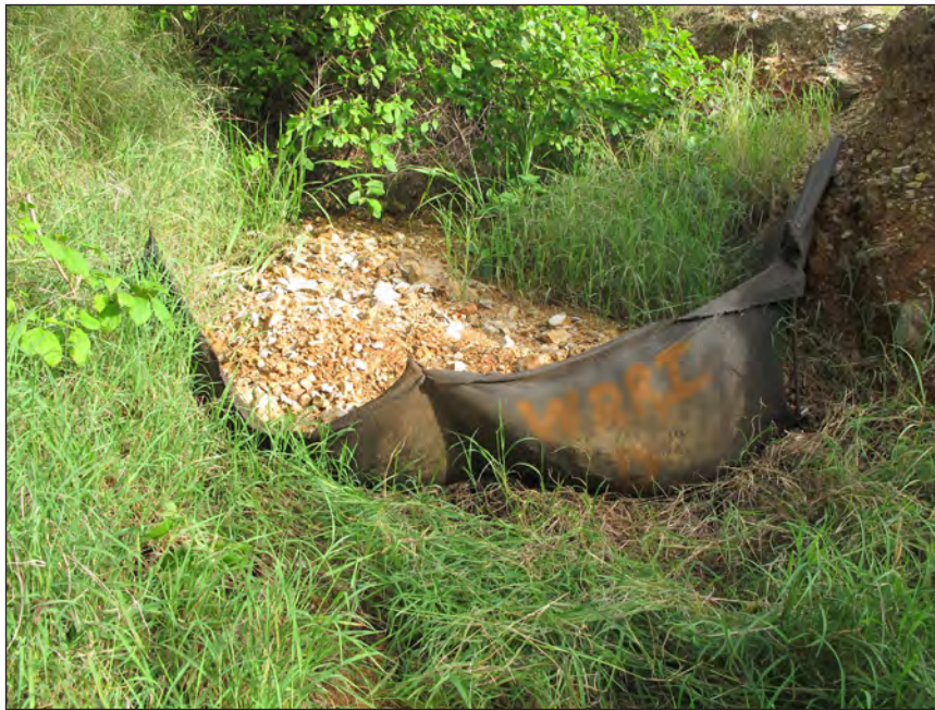
Accumulated sediment from trail surface erosion.

The study results showed that trail surfaces produced sediment at a rate that was just over 20 times faster than the rate at which sediment was produced from undisturbed hillslopes. This difference became more impressive when we considered that the undisturbed hillslopes were more than twice as steep as the trails and hence should have had a higher potential for erosion. We concluded that erosion was closely tied with the density of vegetation cover, i.e., low erosion rates were associated with dense vegetation cover and high rates associated with poor vegetation cover. Sediment from undisturbed hillslopes contained much