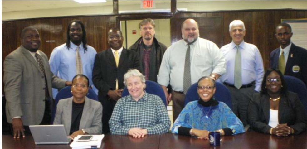
Above: UVI team with members of the Virginia State University (VSU) shared governance task force of the VSU University Council