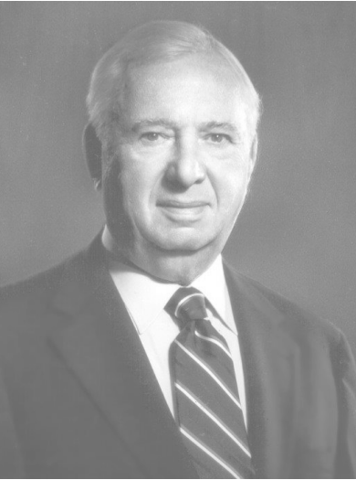
Former Territorial Governor Ralph M. Paiewonsky

In April of 1961, Territorial Governor Ralph M. Paiewonsky used his inaugural address to announce the creation of a college for the United States Virgin Islands. Moving quickly to make good on his promise, Governor Paiewonsky hosted a Conference on Higher Education in July of that same year, at which twenty educators observed and analyzed the Virgin Islands' educational scene, and made recommendations for the creation of the College of the Virgin Islands (CVI).