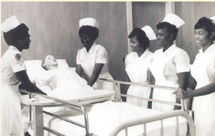
The nursing program was accredited by the National League for Nursing in 1969.

“We are thrilled to observe the history of the program and the commitment our nursing faculty, students and graduates have made to support