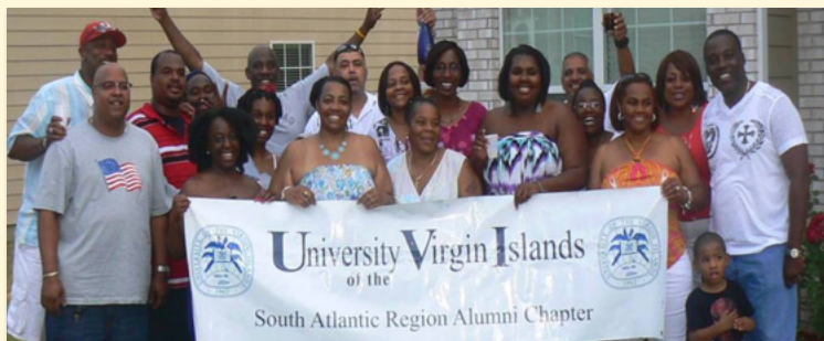
The University of the Virgin Islands' South Atlantic Region Alumni Chapter held a Fourth of July barbecue in Georgia to celebrate UVI's 50th Anniversary Golden Jubilee.

"Our alumni fully embraced the '50 for 50 Challenge,'" she said.