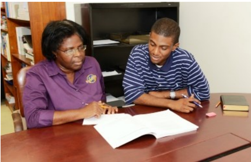
Teaching and Learning. Writing Center. Albert A. Sheen Campus, St. Croix