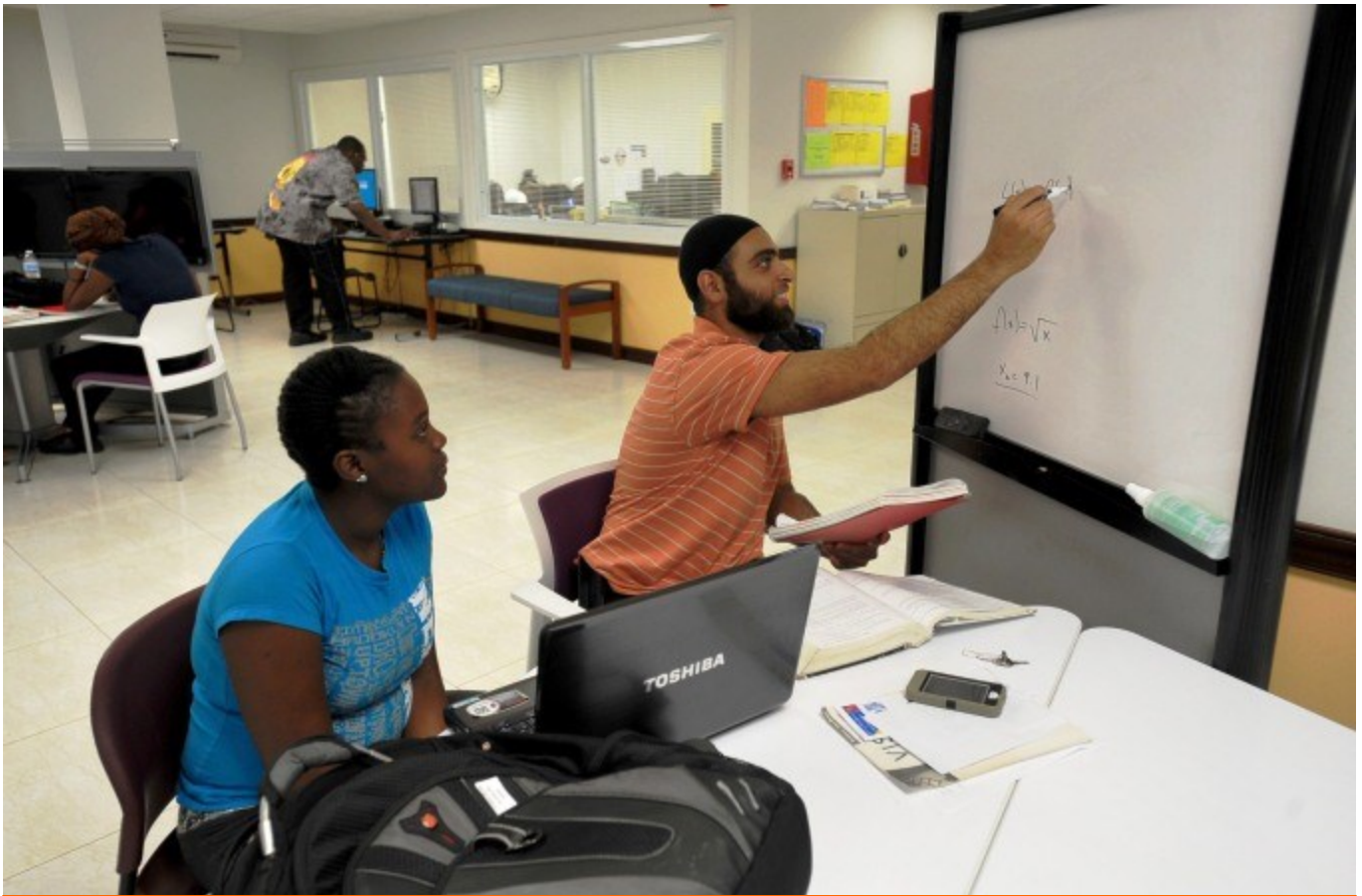
Learning in Action. CSS Learning Center. St. Thomas Campus