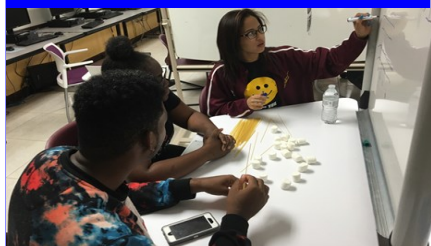
St. Thomas Campus Summer Bridge students

The Center for Student Success Summer Bridge 2016 Program is a program that is designed to assist students better transition from high school to college. The program was held June 26 - July 29, 2016.