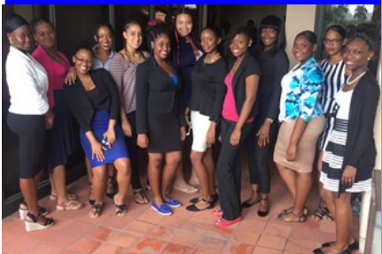
Albert A. Sheen Campus, St. Croix Summer Bridge

The Center for Student Success 6 th annual Summer Bridge Program on the Albert A. Sheen and the St. Thomas campuses were a success.