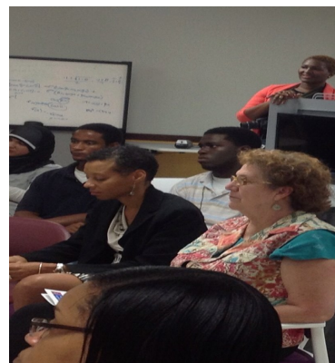
Opening of the Learning Center

sistants and approximately seventeen (17) Learning Assistants on a rotating schedule to accommodate the students' needs.