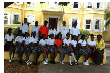
Students who came for afterschool tutorials

"University Bound is for high school students from low income families and potential first generation college students"