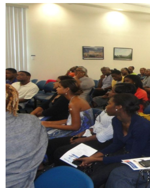
2012 Summer Bridge Students

A similar program was offered for non-traditional students. This program was offered on a part-time basis from March 2012 through August 2012. Students were offered the same courses and were given placements tests at the end of each course. A number of these students registered for the Fall 2012 semester.